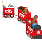
Do not change the shape of the train