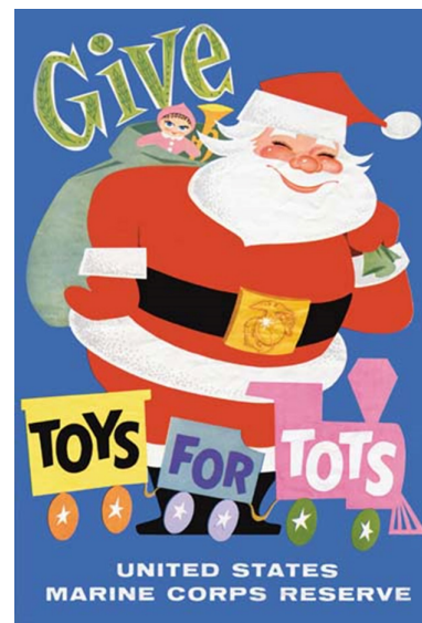
Original Poster Designed by Walt Disney